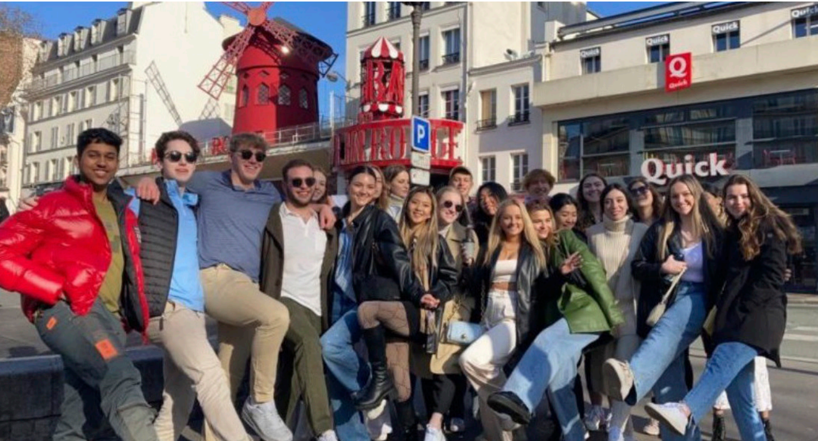
G272 STUDENTS SHOWING OFF THEIR BEST CAN-CAN MOVES OUTSIDE OF THE MOULIN ROUGE IN PARIS, FRANCE. STUDENTS WERE ABLE TO LEARN ABOUT THE ECONOMY OF HANDCRAFTED LUXURY ITEMS AS WELL AS VISIT CULTURALLY SIGNIFICANT LOCALES.

In a global business environment, it's important that students have some understanding of different cultures. Therefore, the Kelley School wants to send the maximum number of their students abroad. Of course, not all students can spend a semester or year overseas due to financial or curriculum constraints.