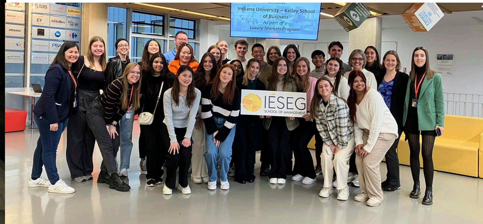
G272 STUDENTS VISIT THE IÉSEG SCHOOL OF MANAGEMENT IN LILLE, FRANCE.

"It was fascinating to see the contrast between the fast-paced life in Paris and laid-back countryside life in Reims," she says. "As an international student, studying abroad has always been an exciting prospect for me. I wish we had more opportunities in Kelley for short-term study abroad programs like G272!"