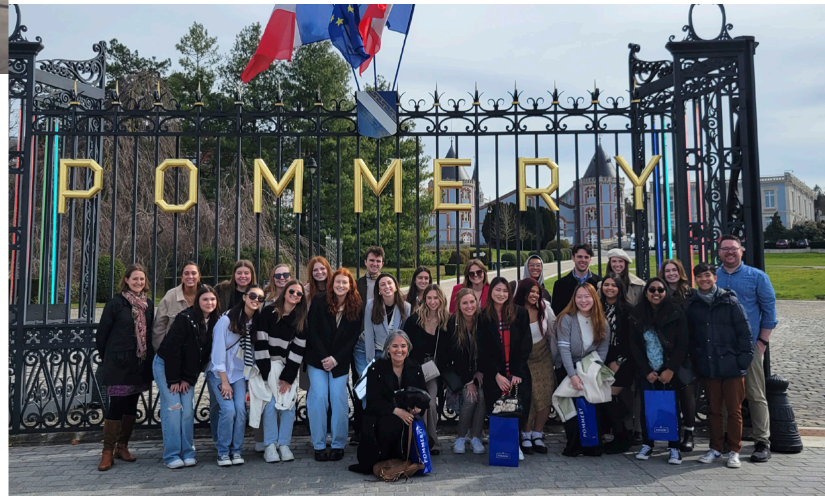
PROFESSOR ELLIE MAFIE-KREFT IS SEATED CENTER IN A GROUP PHOTO WITH STUDENTS OUTSIDE OF THE POMMERY CHAMPAGNE HOUSE WHERE STUDENTS LEARNED HOW THE ICONIC SPARKLING WINE IS MADE.