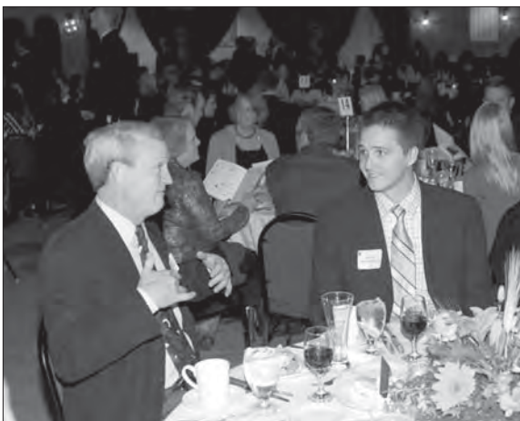
Kelley MBA students had an opportunity to visit with Indiana entrepreneurs at the Indiana Entrepreneurial Leadership Awards program.

Muncie Fort Wayne Indianapolis West Lafayette Indianapolis Noblesville West Lafayette West Lafayette West Lafayette Bloomington Indianapolis West Lafayette Carmel Warsaw Carmel South Bend Indianapolis Ft. Wayne Anderson Ft. Wayne West Lafayette Lafayette