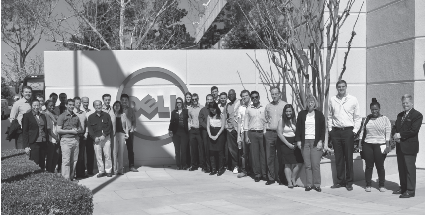
Kelley MBA Entrepreneurial Innovation Academy students visit Dell SonicWall during the annual Velocity Conference

The 14th annual Velocity Conference was held in mid-March on the UC Berkeley campus, and in Silicon Valley in California for the Kelley first year MBA Entrepreneurial Innovative Academy (EIA) students. Joining the MBA students at UC-Berkeley were twelve IU graduate students from the School of Informatics & Computing and the College of Arts & Sciences.