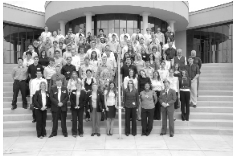
Participants in Entrepreneur Day.

Students were also able to network with Cook managers and look at product displays of medical devices made by Cook. The day ended with a tour of the facility so students could see the hand crafted detail that goes into Cook's specialty devices.