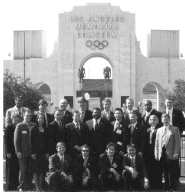
IU delegation to this year's Velocity Conference.

Previous Velocity Conference co-hosts have included Syracuse University, Stanford University, the University of Texas, the University of California at Berkeley, and Boston University.