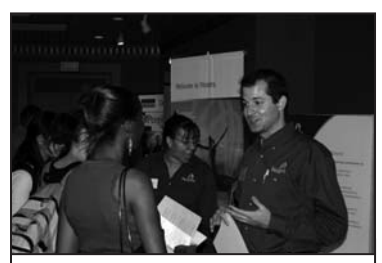
Students talk to Hospira during the fall IU College of Arts and Sciences and Kelley School of Business Life Science Career Fair.

In an effort to work in partnership with various departments and schools across campus, JCEI pooled resources with the IU College of Arts and Sciences to hold a Life Science Career Fair in early October.